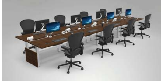
Stand up computer workstation

• Acrylic or tackable privacy/modesty screens available,