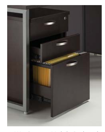
16W 3 Drawer Mobile Pedestal