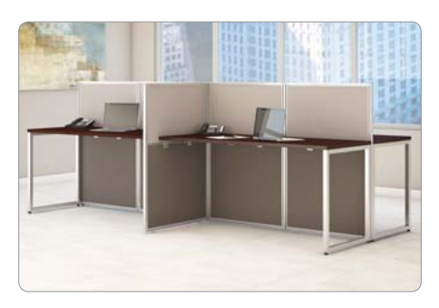
60W 4 Person Straight Desk Open Office EOD660MR-03K