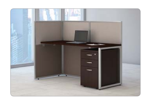
60W Straight Desk Open Office with 3 Drawer Mobile Pedestal EOD160SMR-03K

Intended for open office environments, ideal for: small business, start-ups, corporate call center, study areas, hoteling spaces and more.