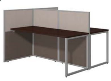
60W 2 Person Straight Desk Open Office EOD460MR-03K