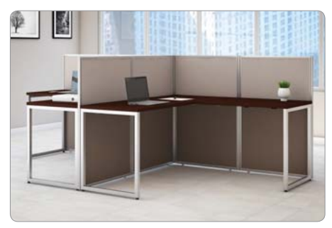
60W 2 Person L Desk Open Office EOD560MR-03K