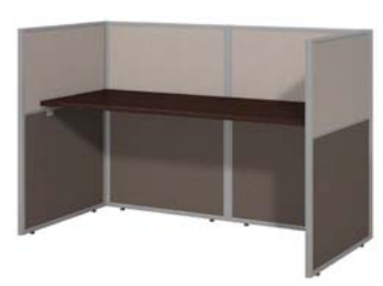
60W Straight Desk Closed Office Cubicle Furniture EOD260MR-03K