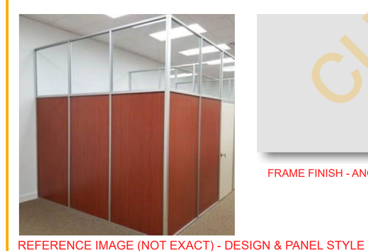
FRAME FINISH - ANODIZED SILVER